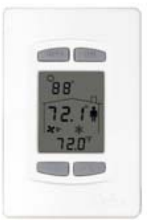
Figure 35: Delta DNT-103 Programmable Thermostat

• This thermostat network has the capabilities of the nightly "over-ride" mode and occupant control during the day.