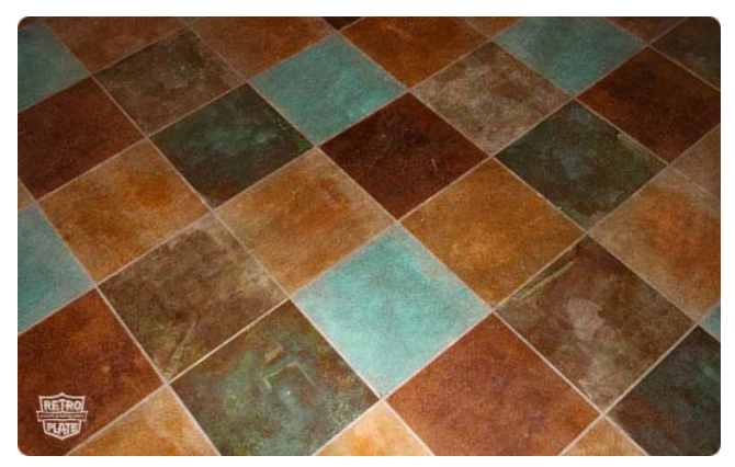
Figure 34: Polished Concrete Flooring