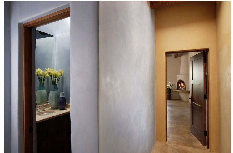
Figure 32: Stained Plaster (Left), Painted Plaster (Right)